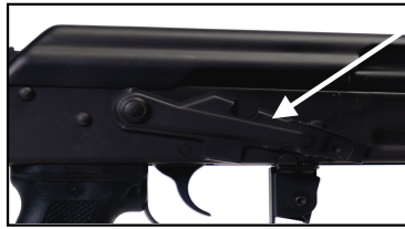
Safety lever in lower or “FIRE” position. Pulling the trigger when the safety lever is in the lower position will result in the rifle firing if there is a round in the chamber! Exercise extreme caution when handling rifle in this condition.