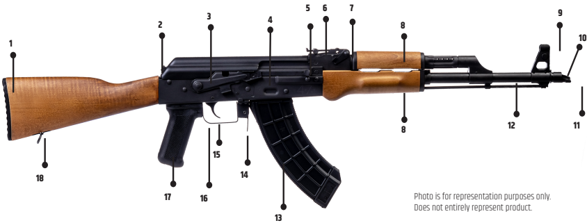
Photo is for representation purposes only. Does not entirely represent product.

Study of this picture will aid you in understanding the instructions in this booklet.