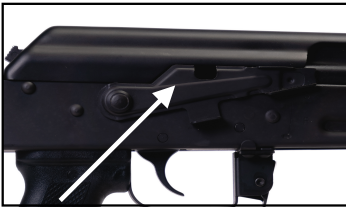
Safety lever in upper or “SAFE” position.